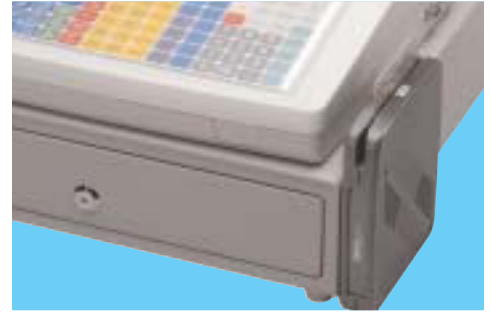
DataTran™ Integrated Credit Option