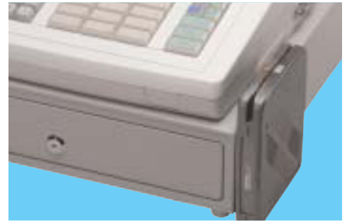
DataTran™ Integrated Credit Option