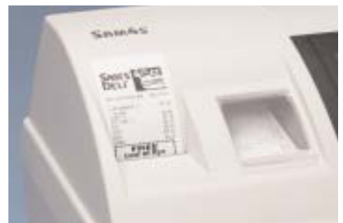
Quick and Easy Drop-In Paper Loading