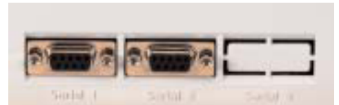
Two Standard RS-232C Ports